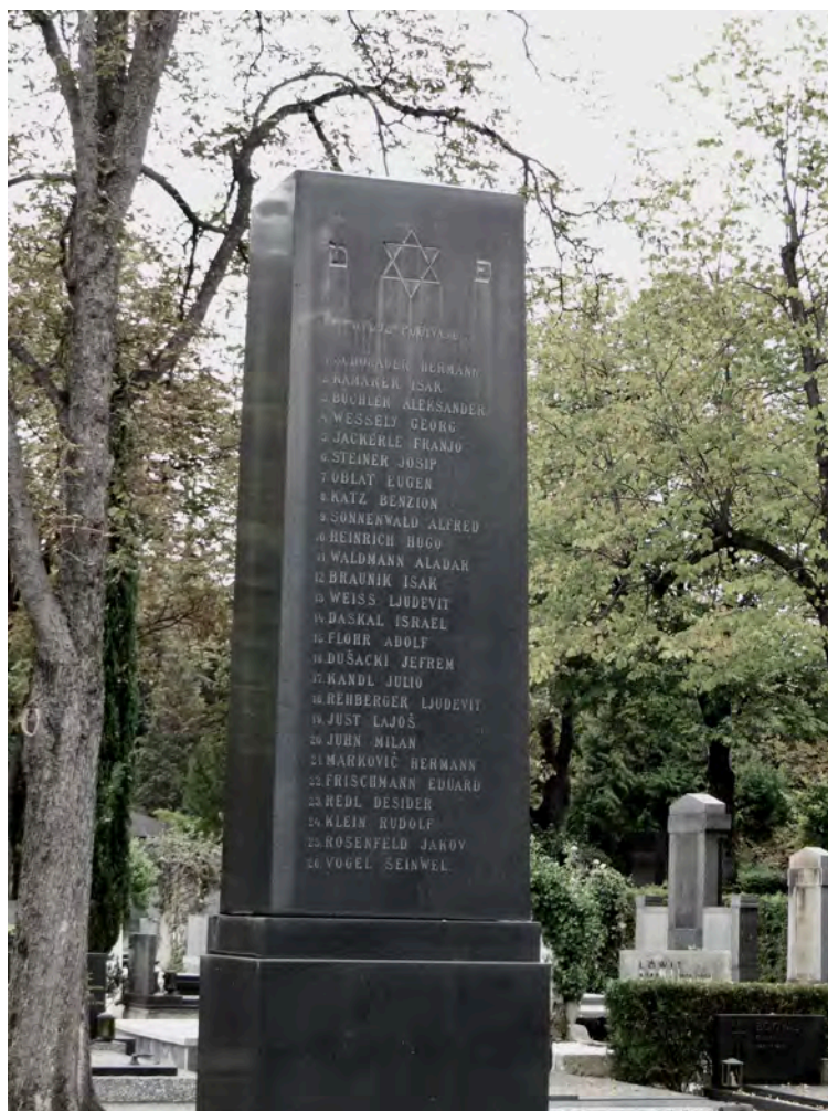
Fig. 1. Detail of the monument to Jewish war victims, Mirogoj cemetery (Zagreb, 1930)

them inhabitants of Croatia and Slavonia – who died and were buried in Zagreb [Fig. 1].