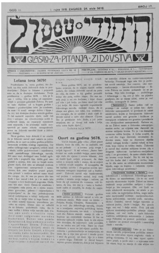
Fig. 3: Židov: Hajehudi, glasilo za pitanja židovstva